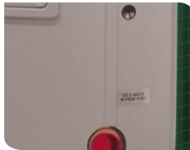
UV-protected PVC shell won't rust or deteriorate