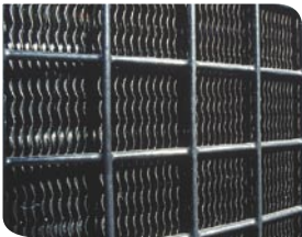
Protective, vinyl-coated steel screen

Hayward® builds a heat exchanger that completely heats all the water without allowing corrosive water to touch metal anywhere within the heat pump. Unlike copper heat exchangers, the ArmourCoil heat exchanger is protected with an exclusive coating that isolates the metal from damaging, chemically treated pool water, preventing corrosion and scaling and providing a longer life for your heat pump.