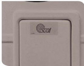
Sealed electrical access panel